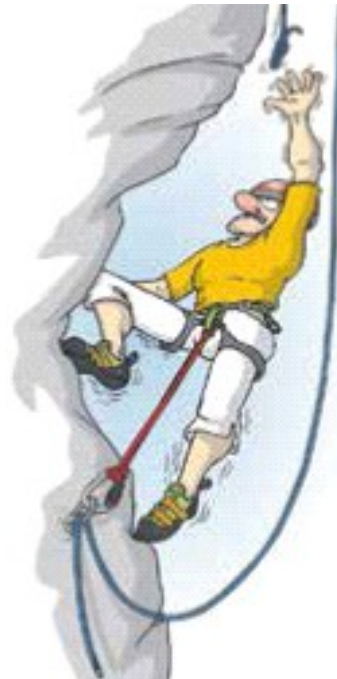
Fig. 5: Caution! Big falls into a clip-in sling can cause it to fail.