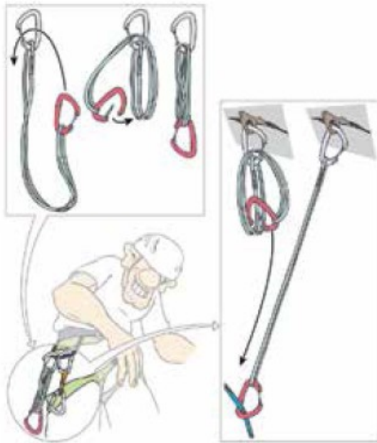
Fig. 2: The 'alpine quickdraw' can be readily extended to straighten the course of the rope.