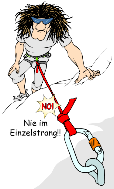
Fig. 3: Webbing in a single strand is dangerously weakened by knots. Never in a single strand!